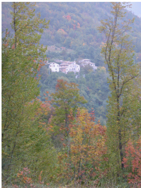
The small hamlet of Le Cese

Continue West-South-West along the tarmac and concrete streets, past the holiday villas, until you arrive at the large parking area in front of the Hotel Pintura. There are refreshments available in Pintura di Bolognola at peak times, but this predominantly skiing town is surprisingly quite on all but the busiest summer days.