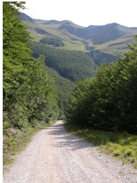
The Anello long distance path, between points ③ and ④.

Go left on the white road, still heading North, passing a track to the left which is marked as routes '3' and '15'. After 100 metres the white road bears left to approach a small group of buildings (Casale Calcagnoli), where there is a small shrine and spring. Here, the road becomes tarmac, and you follow it North for just over one kilometre, through Mezza Villa and Giampereto, then downhill back to Abbadia.